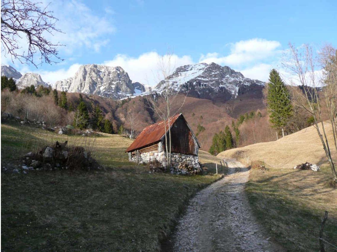
Fig. 3. Above the junction, there is a grassy hill on the right for fat and lazy birders (my scope observation point). Alternatively, walk left hand, across pastures, and climb up to the snow limit, if you are up to it. The partridges were beyond the trees on the left, at snowline (visible from the grassy hill, just like the top of the mountain). In winter, they probably descend all the way down to the village.

See: http://www.maplandia.com/slovenia/kobarid/ for satellite images.