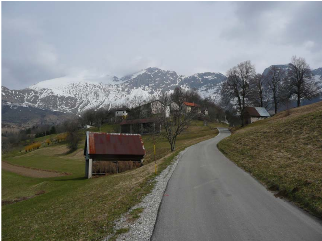
Fig. 1. On the way up to Krn Mountain (on the background). As you see, the road is narrow but fine.