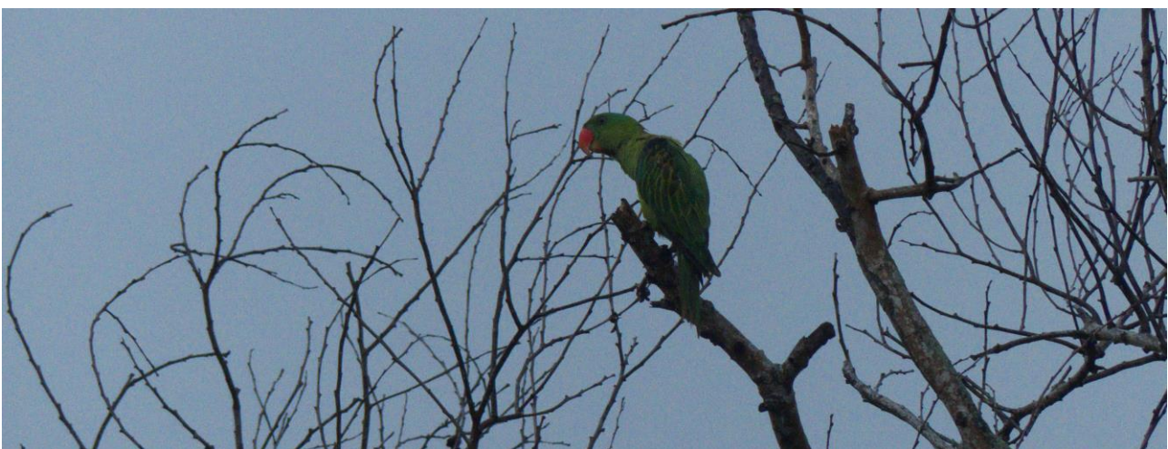
Fig. 2. An overcast, rainy day at Tanjung Aru. A Blue-naped Parrot observes the hotel area.

Tanjung Aru is well known for its (feral) population of Blue-naped Parrots , which are readily seen around the Casuarina Hotel. In early mornings and late afternoons, I did some scanning of the treetops, where many common birds such as Green Imperial Pigeons congregated. A third floor balcony proved to be ideal for that. On the 30 th July, I got lucky, when a Grey Imperial Pigeon appeared at the site. The somewhat nomadic species may be seen at the close-by protected islands (Tunku Abdul Rahman Park), from where occasional visits to the coast are made.