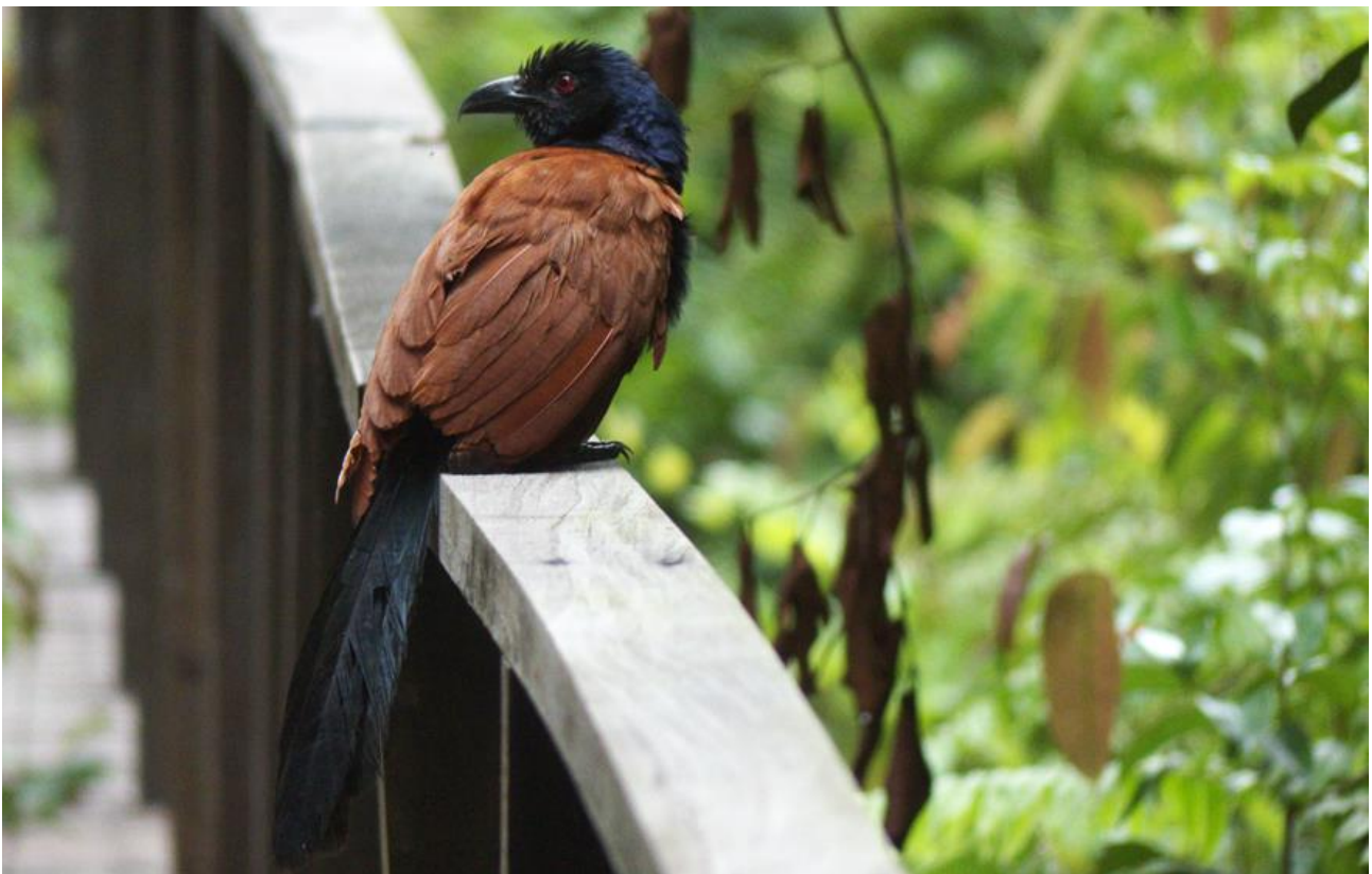
Fig. 3. A relaxed bubutus Great Coucal at the Klias Peat Swamp boardwalk. It stayed at its vantage point as I said good bye and left the place.

Good luck with your visit in Klias Peat Swamp and Kuala Penyu!