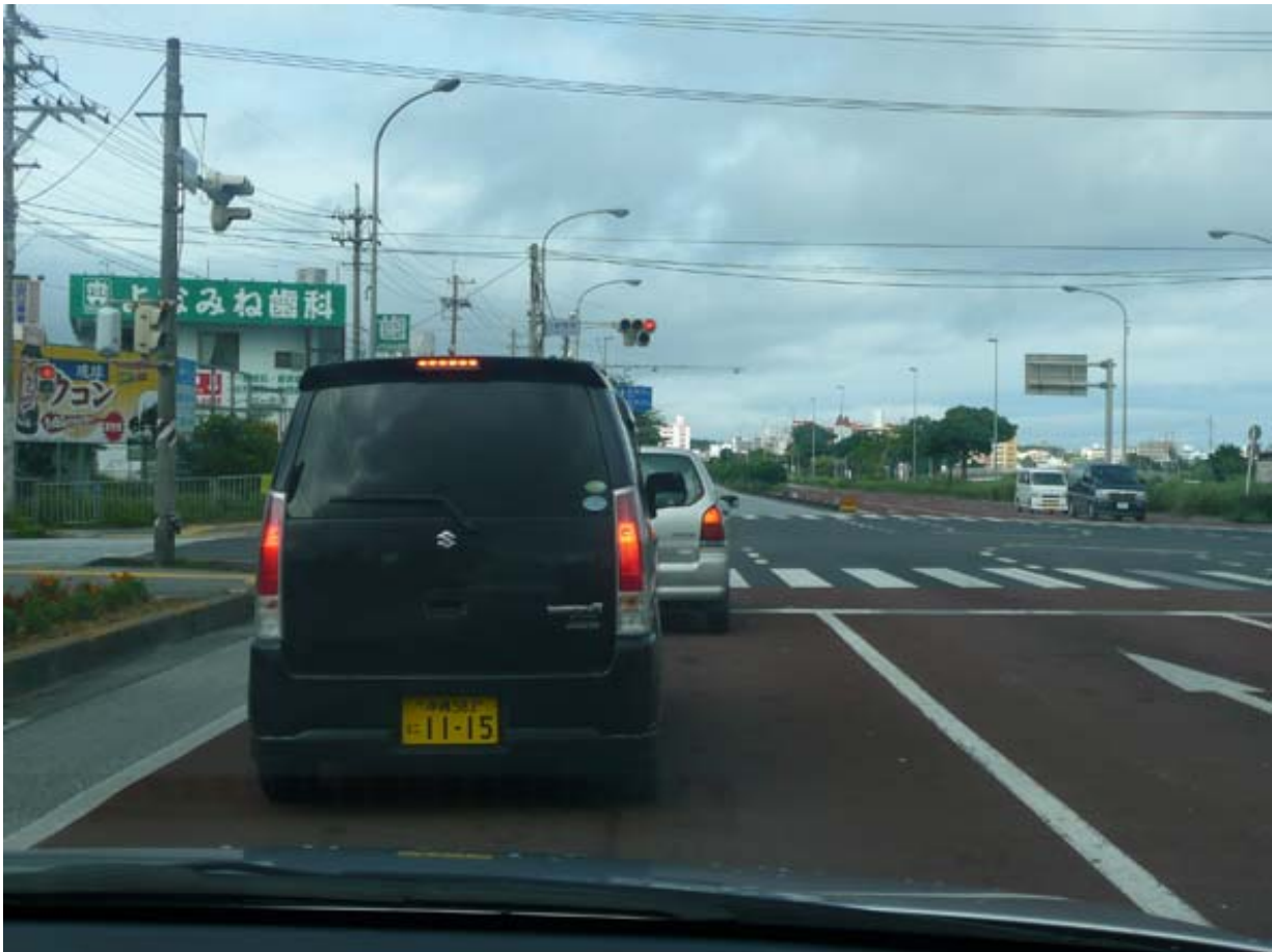
Fig. 8. Traffic lights at Nagu, with 'cubicle cars', the current favorite in Japan.