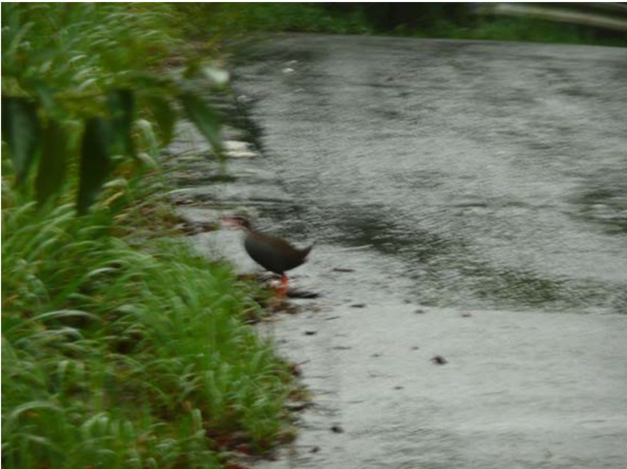
Fig.6. ...and the bird itself. Not enough light for my camera even though the rails walked around the car!