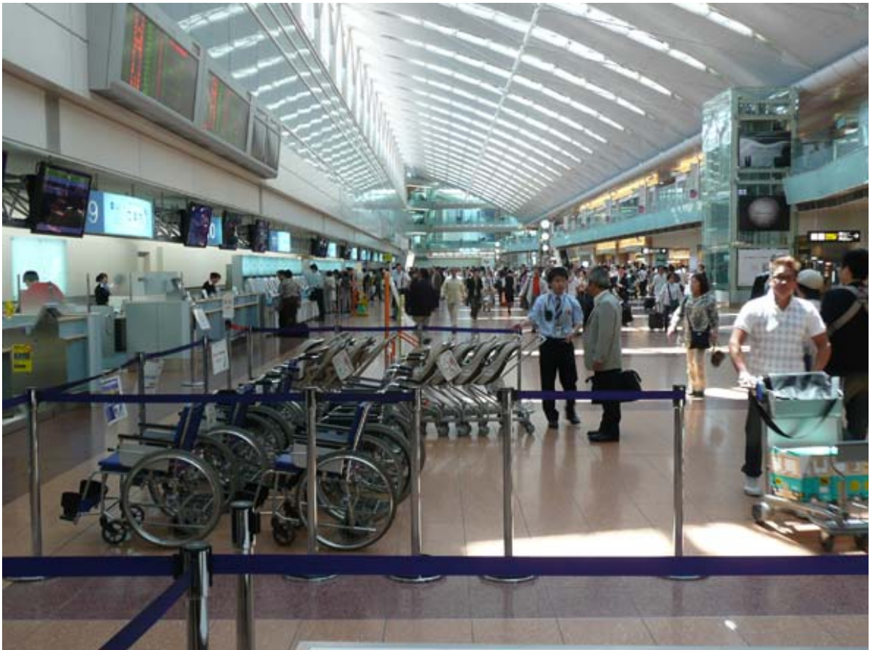
Fig. 1. Haneda Airport, Terminal 2.