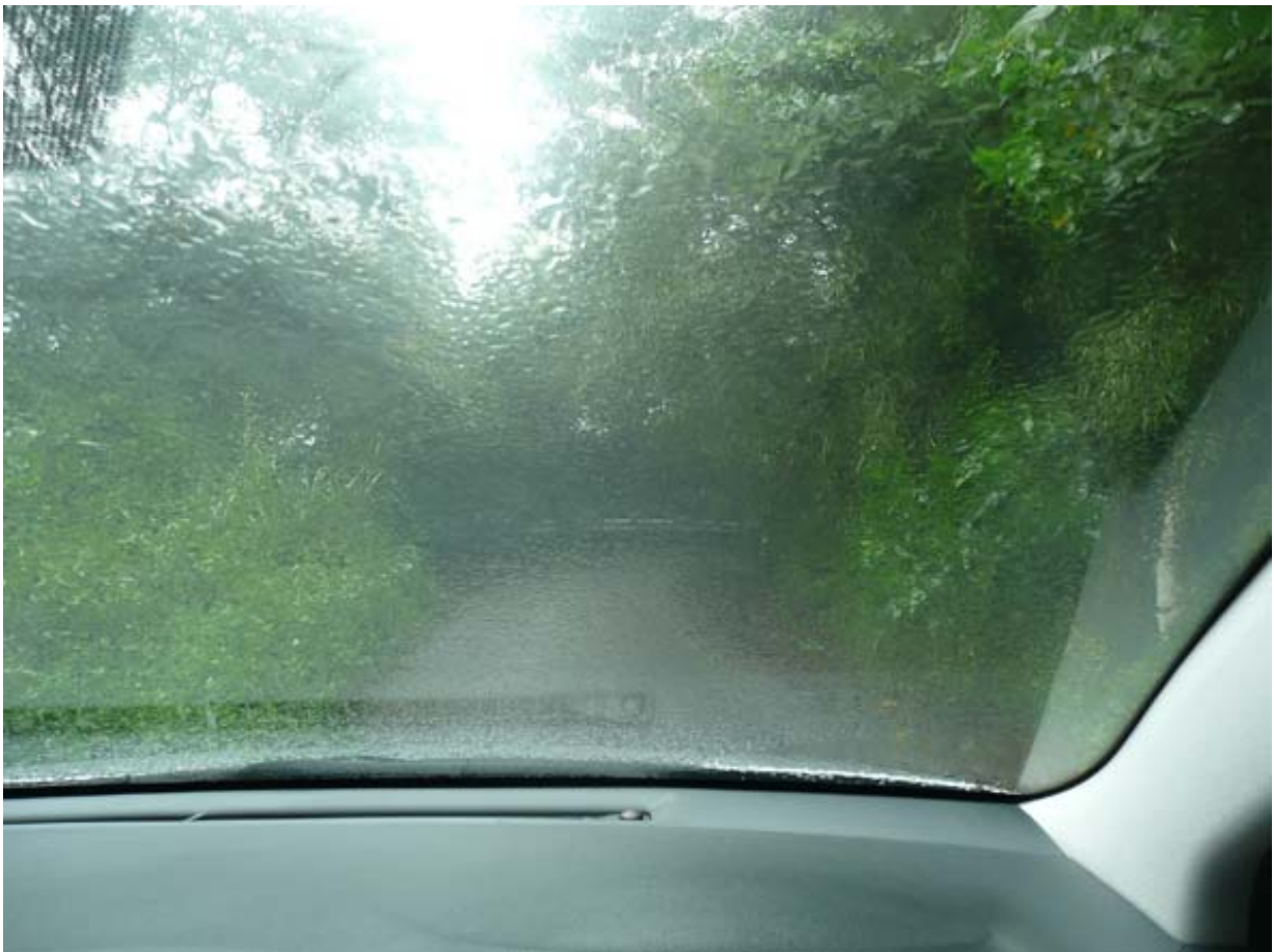
Fig.4. Dense rain at Terukubi Rindo – not possible to see anything.