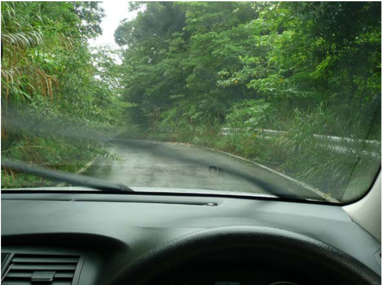
Fig.3. Light rain at Terukubi Rindo – good birdwatching from the car. See the tarmac road.