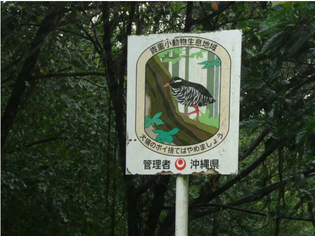
Fig.5. One of the many Okinawa Rail signs...