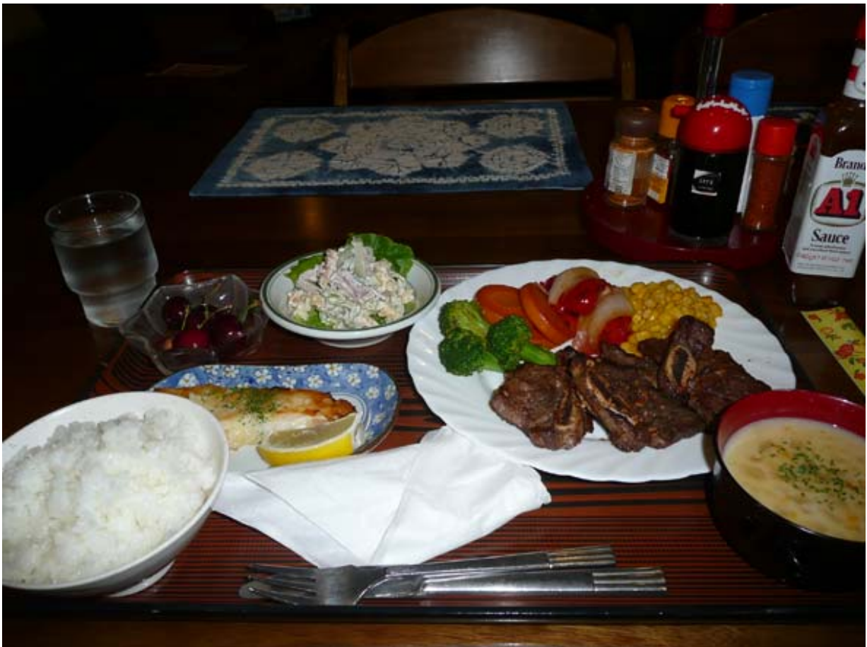
Fig.2. My Kunigami Hotel dinner – excellent! Everything was fresh and very well prepared.